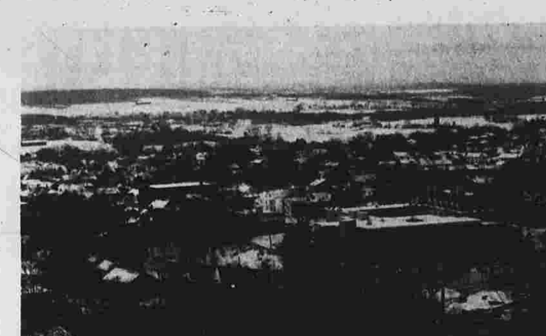
VIEW FROM FOX HILL, ROCKVILLE

One of these, the instant solution arrived. Henceforth, said the Institute of Scrap Iron and Steel, we should not label old automobile or refrigerator bodies as junk.