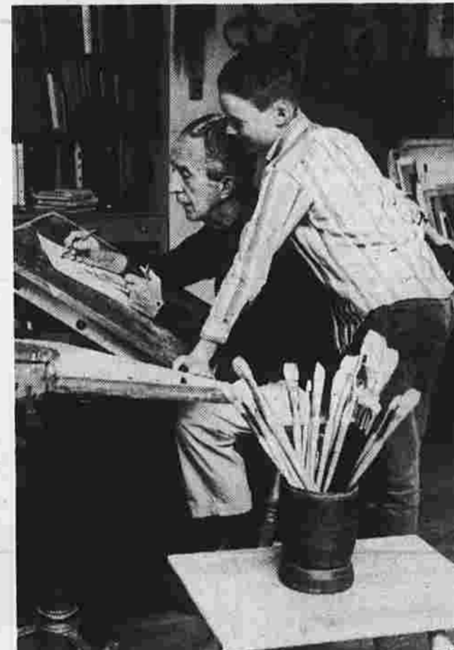
"Just me and a model and critic."