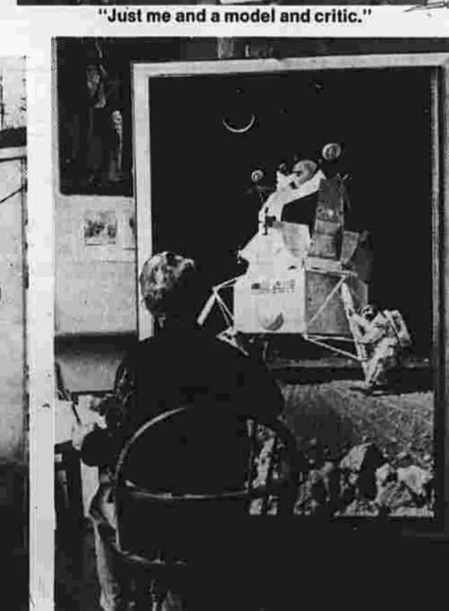
"I have painted four pictures of the moon shot for publication. The originals are all hanging at the Smithsonian Institute in Washington."