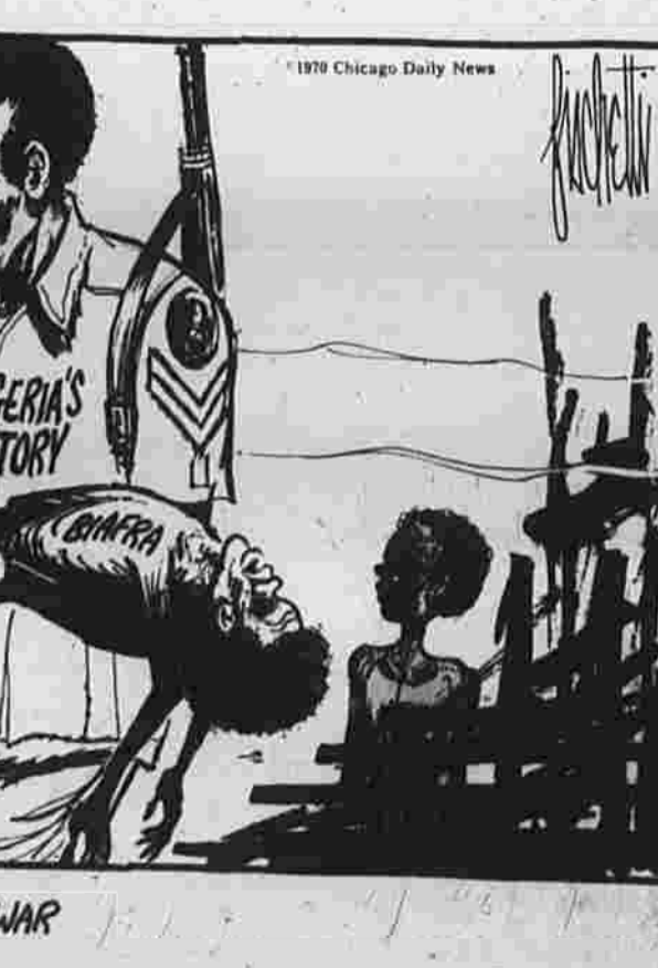
THE SPOILS OF WAR

Fischetti A gap of over $15,000 exists between the pay scale demands of teachers and a salary increase considered "reasonable and realistic" by a Board of Education subcommittee.