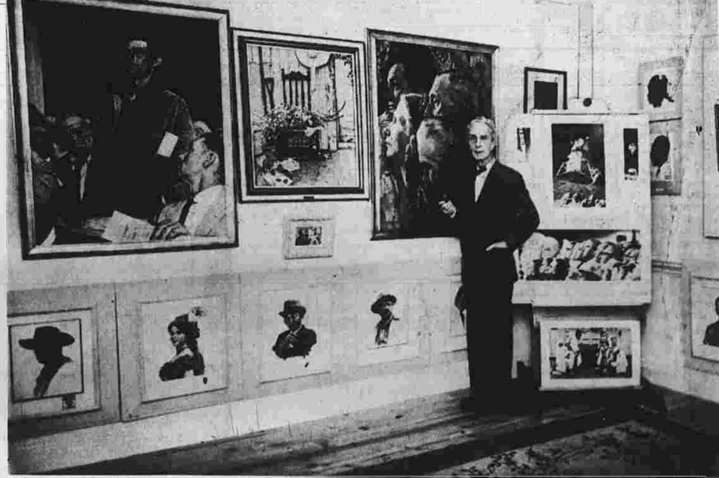
Norman Rockwell in the Old Corner House, Stockbridge, Mass., where 40 originals of his work hang permanently.