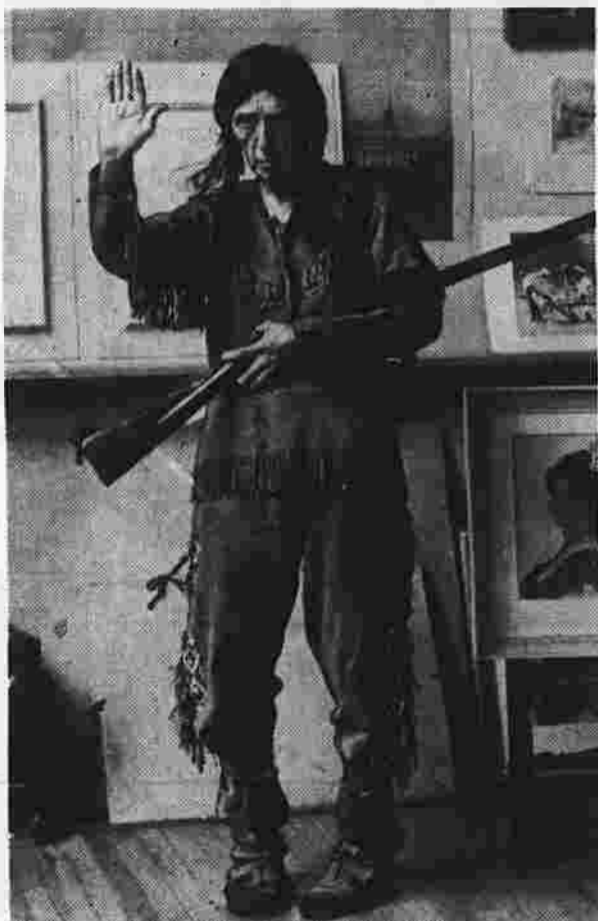
In an Indian costume used to paint a picture for the movie, "Stage Coach."