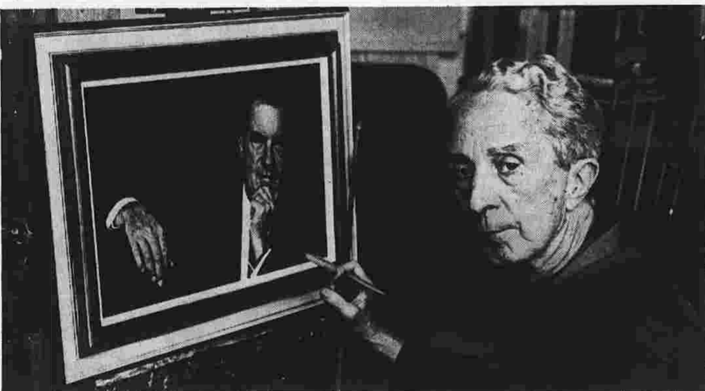
"I painted all seven Presidential hopefuls in 1968..." This one of Nixon was painted after the election.